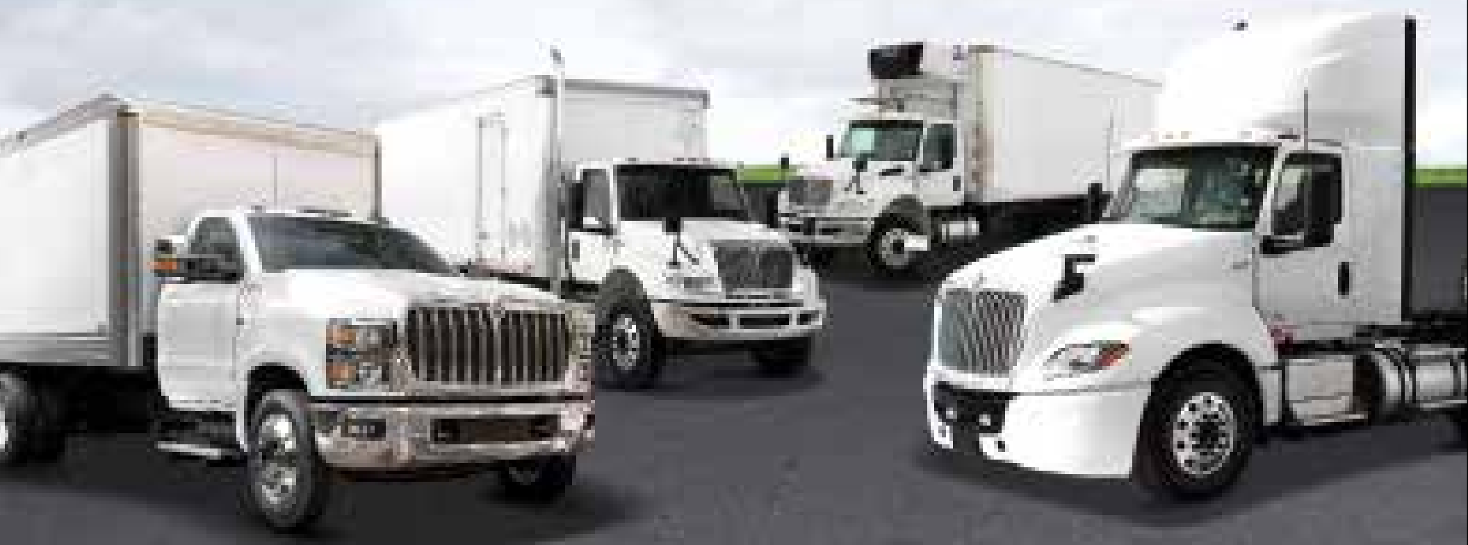
3-Ton Van Trucks