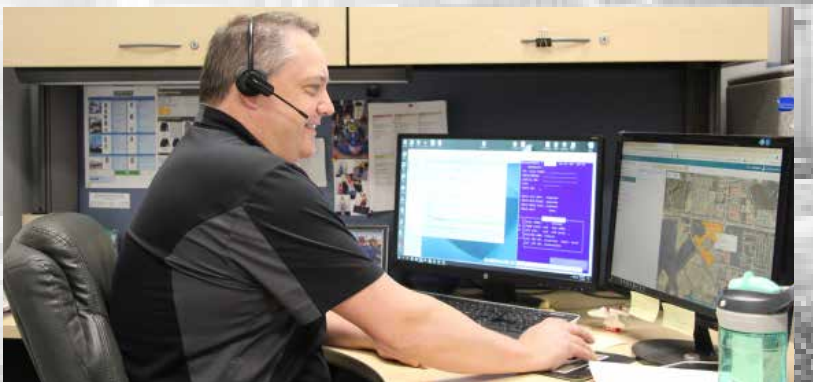
Maxim's Central Fleet Maintenance Team

Maxim has 24/7/365 resources dedicated to our Lease and Rental customers across Canada. Our support of our customers is what separates us from our competitors. Before you sign on the dotted line, consider the ongoing Fleet Management capabilities of your provider.