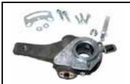
Slack Adjuster, Auto