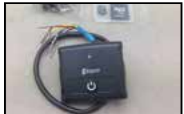
Controller, Multimax F-1000