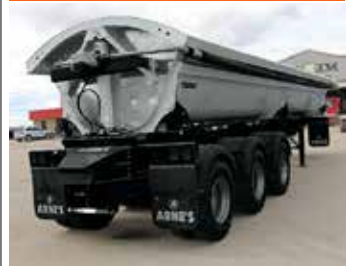
New Side Dumps Available Now