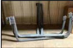
Tire Carrier, Large