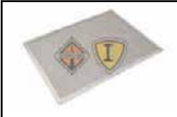
Glass, Rear Top Door