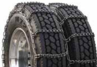
Clearance Parts at Over 40% Off