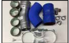
Kit, ISB CAC Port Plug