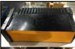
Standard Efficiency Engine Air Filter