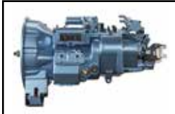
Transmission, Eaton Fuller