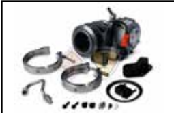
Retrofit Kit, Turbo, TMV