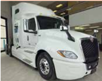
S13 Sleeper Trucks In Stock