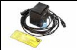
ABS Kit, Trailer, TABS-6 Replacement