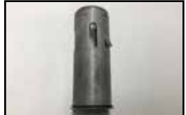
FTA-25-675 Anti Siphon W/2.75" Neck 6.75