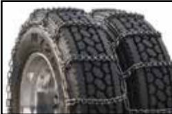
V-Bar 7MM 22.5 Triples