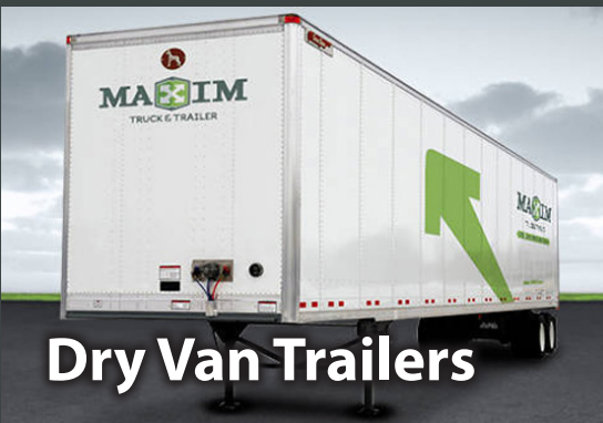
Dry Van Trailers