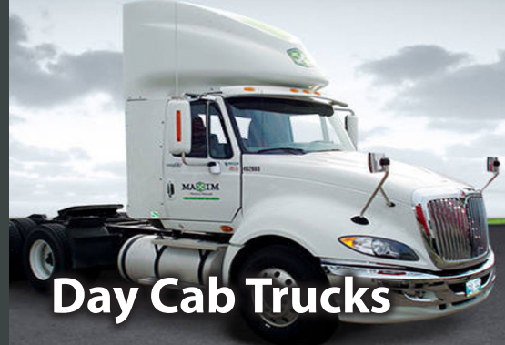
Day Cab Trucks